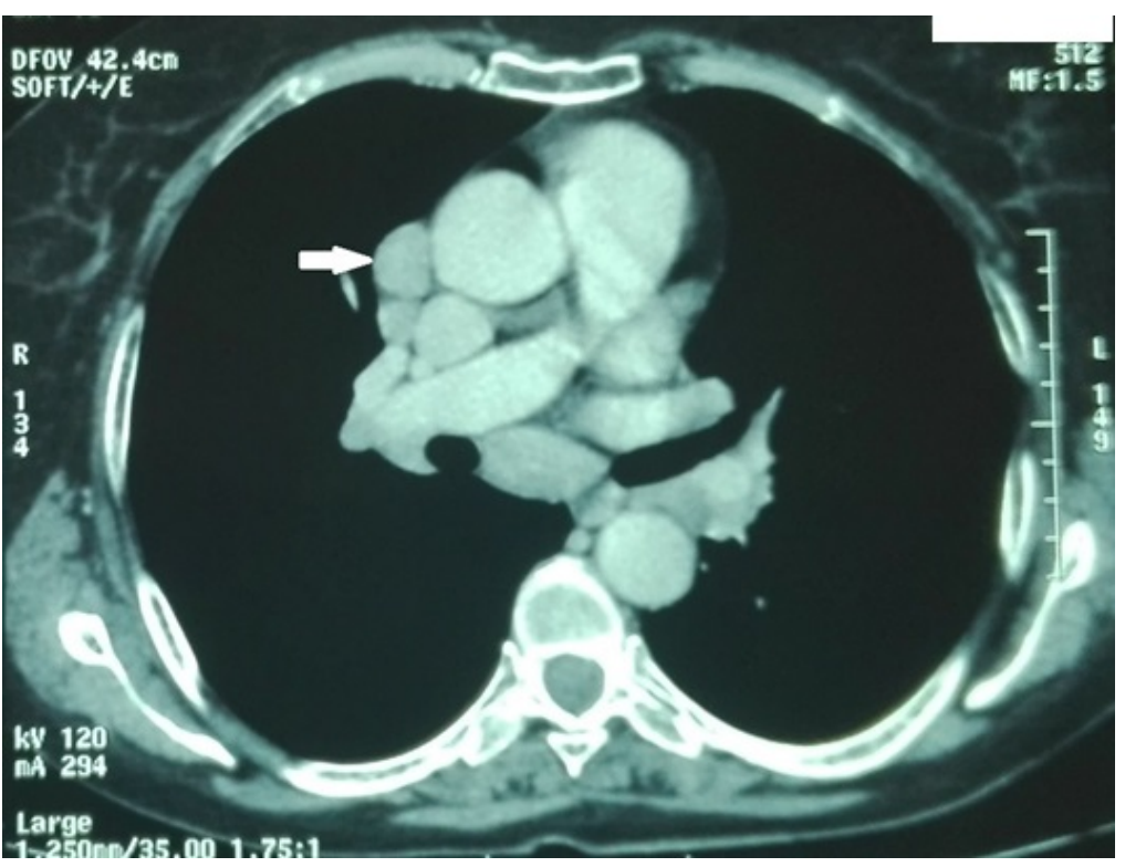
Figure 1: Axial section of a thoracic CT scan with contrast injection showing mediatinal lymphadenopathy (white arrow) in relation to stage I sarcoidosis.

Our observation illustrates an original case of Graves' disease, the course of which was marked by the onset of active sarcoidosis presented as Löfgren's syndrome complicated by hypercalcemia. Given its rarity and the lack of a causal link, the association between Graves' disease and sarcoidosis may be mere coincidence. More studies could allow us to understand more common etiopathogenic mechanisms, as both are chronic inflammatory pathologies and a common immune mechanism appears to be behind them.